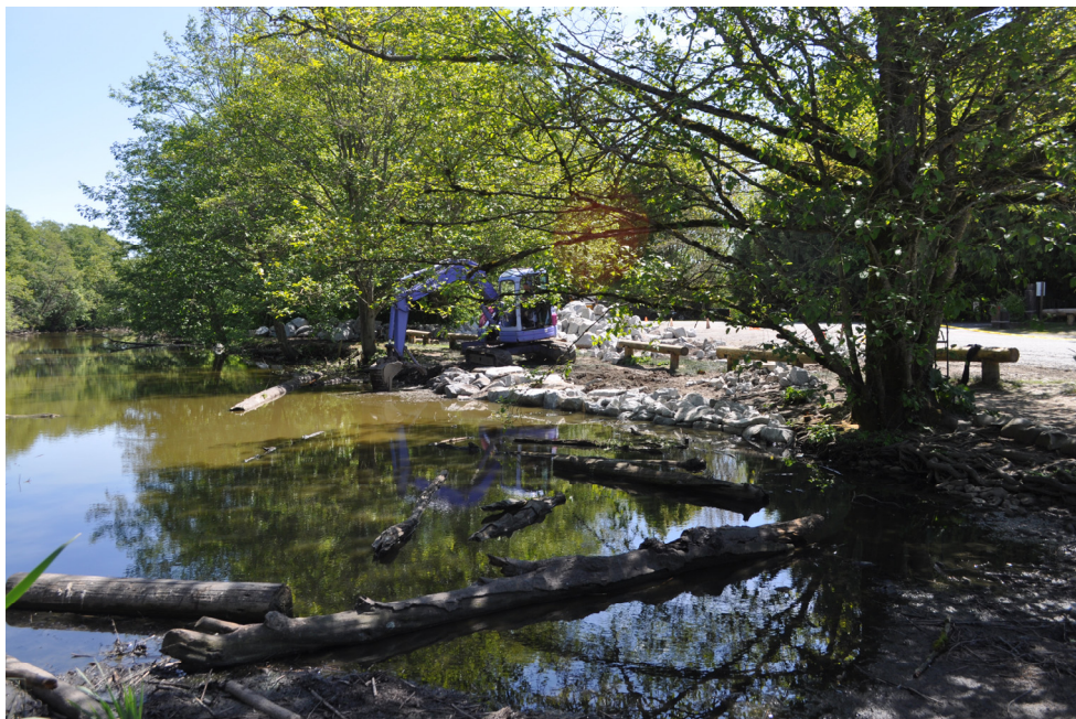
Excavator placing rock along Robertson Slough at the parking lot.

Birdlife continues on as usual while we carrying out these maintenance activities. For most of April and part of May we watched our nesting pair of Sandhill Cranes chase the younger cranes around and then make seemingly random nest choices. See page 10 for the saga that has resulted once again in no young produced this summer.