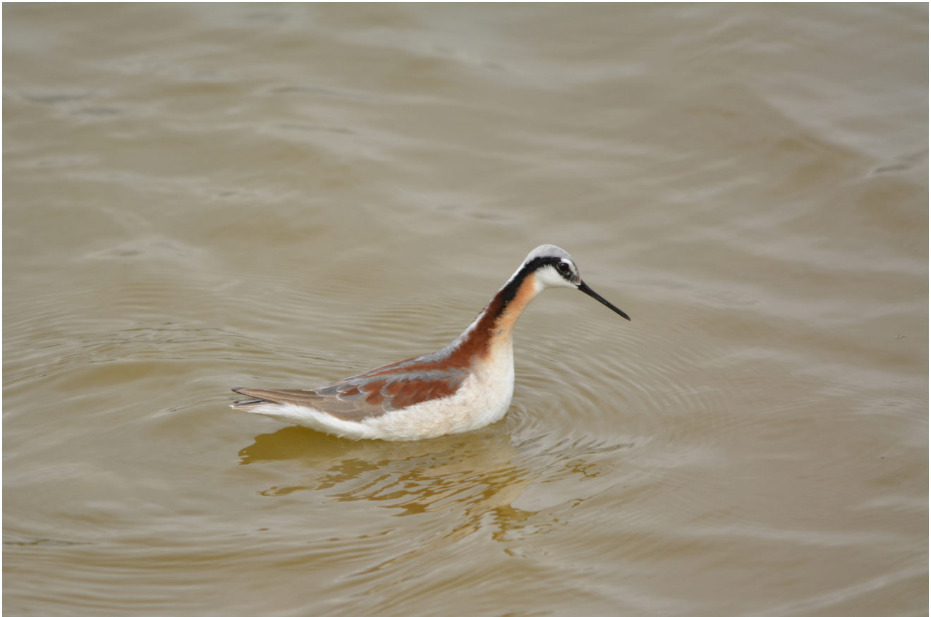
Wilson's Phalarope

PUBLICATIONS MAIL AGREEMENT NO 40924050 RETURN UNDELIVERABLE CANADIAN ADDRESSES TO CIRCULATION DEPT. 330 - 123 MAIN STREET TORONTO ON M5W 1A1 email: circdept@publisher.com