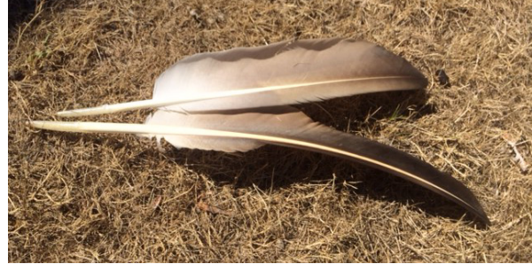
Moulted Crane Feathers

The gang of immature birds or the "young and the nest-less" are still the same (and still here). None of them have graduated to the status of a mature bird with a mate and a nest site. Junior, our 2010 colt, was in charge of the gang this spring, but fought constantly about territories with the resident male, and left after a fight mid-March. He returned in late May. His prolonged absence seems to have resulted in the 4 males of the gang of 6 all assuming they were now in charge, and they have chased him every day since his