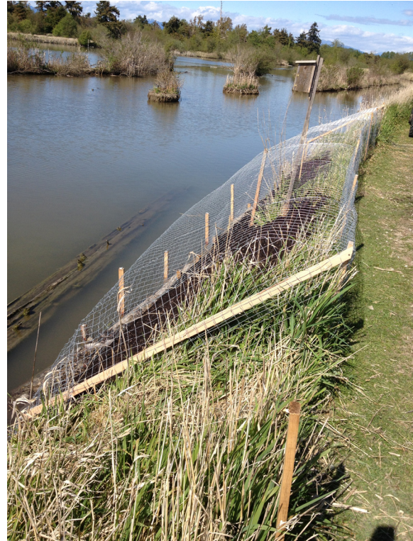
Shoreline restoration cage

It was almost a month before the heron moved to a new perch spot and the Purple Martins could check out their old box. A pair has nested, though. On July 10 th , a male and female, each with an aluminum band