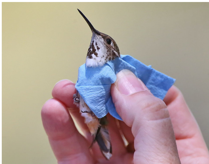
Careful handling of these tiny birds

http://ec.gc.ca/soc-sbc/oiseau-bird-eng.aspx?sY=2011&sL=e&sM=c&sB=RUHU