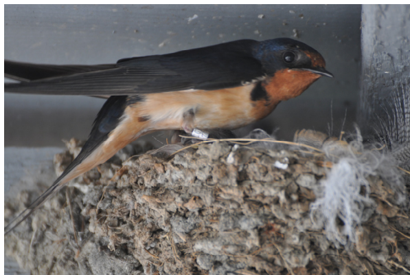
Banded Barn Swallow at Warming Hut Nest June 28th 2015