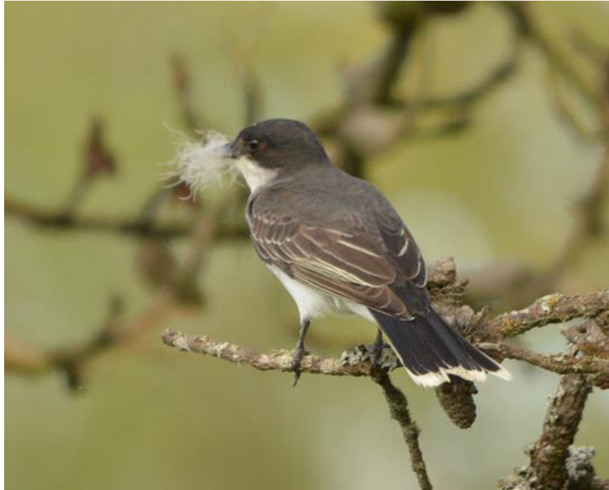
Eastern Kingbird with nest material

Highlights of the week included a Spotted Sandpiper on the 31 st , 4 Bullock’s Orioles on the 4 th , a Green Heron in Fuller Slough on both the 5 th and 6 th , and a Rufous Hummingbird nest on the 6 th . The nest was located across the ditch from the first viewing deck on the east side of the East Dyke. It was built on a blackberry branch. Very good spotting!